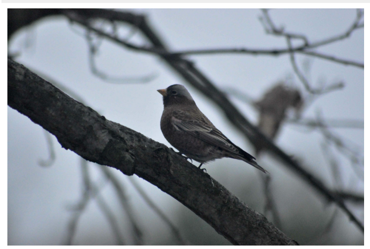
Events - 1240.jpg